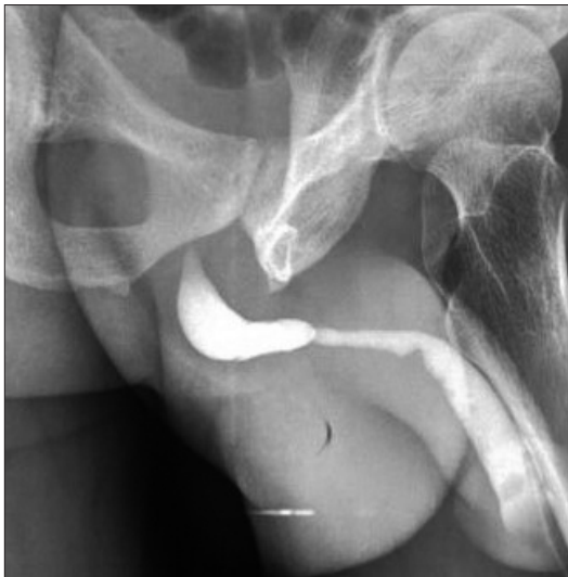
Fig. 1. Retrograde urethrogram (of one of our patients) demonstrating peno-bulbar urethral stricture.