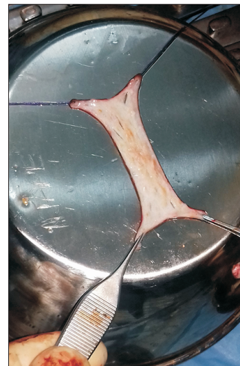
Fig. 4. Harvested 'slit-incorporated' graft (full-thickness skin graft) ready to be used for grafting.

from the cheek(s) and defatted, and a corresponding 5-mm midline incision is made on both ends of the graft (Fig. 4). The graft is then quilted and sutured to the urethral mucosa of the stricturotomy site in the usual manner of watertight (5-mm apart), tension-free (2-mm needle entrance from graft and urethra edges), interrupted anastomosis. The ventral sagittal stricturotomy is then closed over a 16-F 2-way silicone Foley catheter inserted into the bladder via the external meatus and spongiorrhaphy is done. The perineal wound is then closed with simple interrupted mattress stitches.