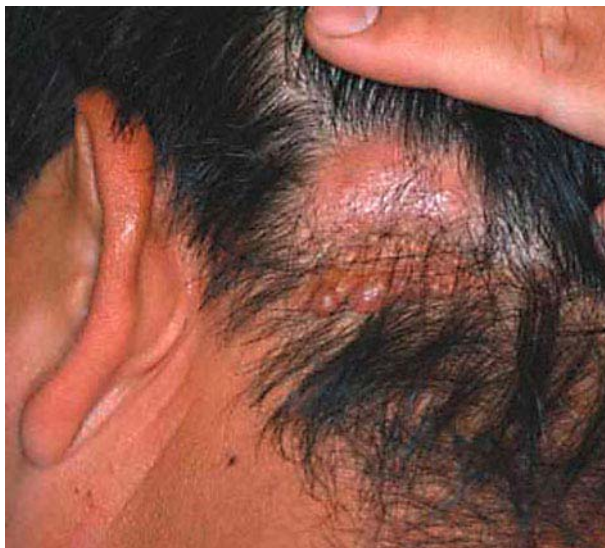
Fig. 1. A skin-colored, well-demarcated tumor located on the left side of the occipital region.

There authors have no financial interests to disclose.