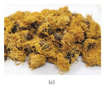
FIGURE 1: The flowers of (a) a radiation-induced mutant cultivar, C. morifolium cv. ARTI-Dark Chocolate (ADC); (b) the original cultivar, C. morifolium cv. Noble Wine (NW); (c) the commercially available medicinal herb, C. morifolium (CM).

our research group has developed a new chrysanthemum cultivar, C. morifolium cv. ARTI-Dark Chocolate (ADC), by gamma-irradiation on stem cuttings of the chrysanthemum cultivar, C. morifolium cv. Noble Wine (NW), and registered a new plant variety (registration number 4996) in the Korea Seed and Variety Service (available online at https://www.seed.go.kr/english/function/system_06.jsp) (Figure 1).