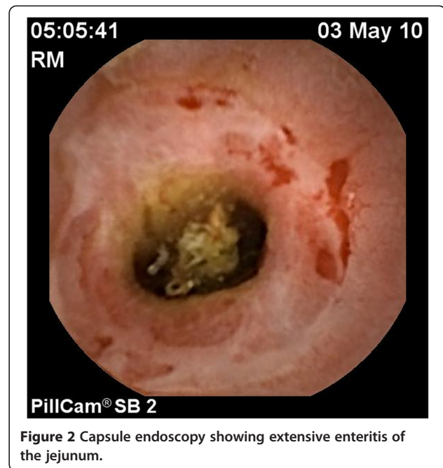
Figure 2 Capsule endoscopy showing extensive enteritis of the jejunum.

1.5 g/l (nr > 8) with reduced IgA of 0.4 g/l (nr > 0.8) but IgM just in the normal range at 0.4 g/l (nr > 0.4). He was referred to the clinical immunology service at Auckland Hospital with suspected Common Variable Immune Deficiency (CVID) with predominant gut involvement. His fecal alpha 1-antitrypsin level was elevated consistent with protein losing enteropathy. The absence of serological markers of his gut disease was thought to be due to the humoral immune defect even though vaccine responses to H. influenzae type B (0.44 µg/ml, protective range >0.15) and tetanus toxoid (0.16 IU/ml protective range >0.1) were preserved. He had low levels of diphtheria antibodies and pneumococcal antibodies, which may have reflected absence of recent immunization. Vaccine challenge responses were not undertaken prior to IVIG treatment, because of the severity of the immune defect. The major immunology results are shown in Table 1.