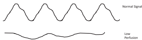
Figure 1 Pleth waveforms.