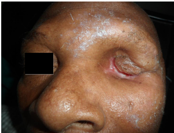
Figure 4 Spontaneous healing of the orbital cavity.

at presentation. A low CD4 + cell count and other immunosuppressive states like diabetes and intravenous drug abuse are predisposing factors for orbital involvement with malignancies in AIDS. 10 All the patients reported to our hospital at an advanced stage of their illness, and OE was the only therapeutic option. Preoperatively, an orbital CT scan revealed no bony destruction and no intracranial invasion in all the patients. Orbital imaging using CT and magnetic resonance imaging give the exact characteristics of the tumor extension and structures involved. 11