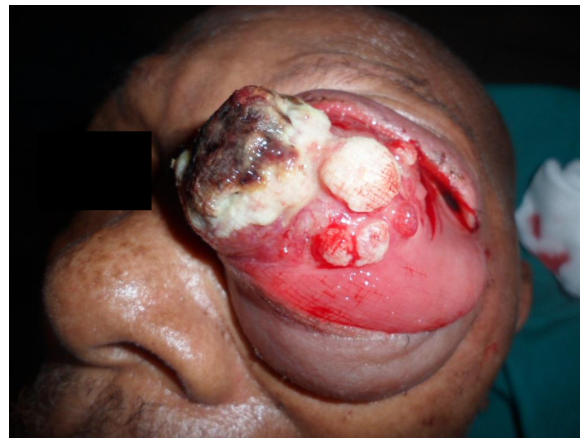
Figure 1 Protrusion of orbital contents.