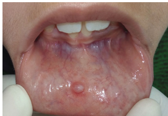
FIGURE 1: Clinical appearance of the mucocele in the lower lip.

The child was followed after 2 weeks: a fibrin network formed over the surface (Figure 5). The wound healed without complications: no postoperative discomfort or pain and no infection were noted. No recurrence was observed. The surface of the lip healed perfectly after 6 months of follow-up (Figure 6).