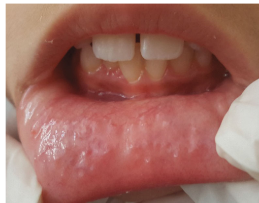
FIGURE 6: Perfect healing after 6 months of follow-up.