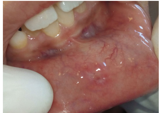
FIGURE 5: After 2 weeks of follow-up: fibrin network recovered the site.