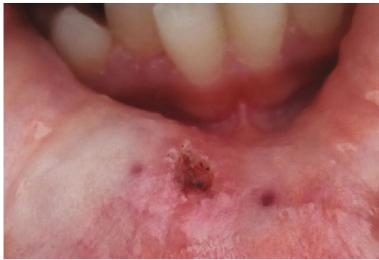
FIGURE 3: Immediate aspect after mucoccele removal: bloodless operative site, no suture was done.