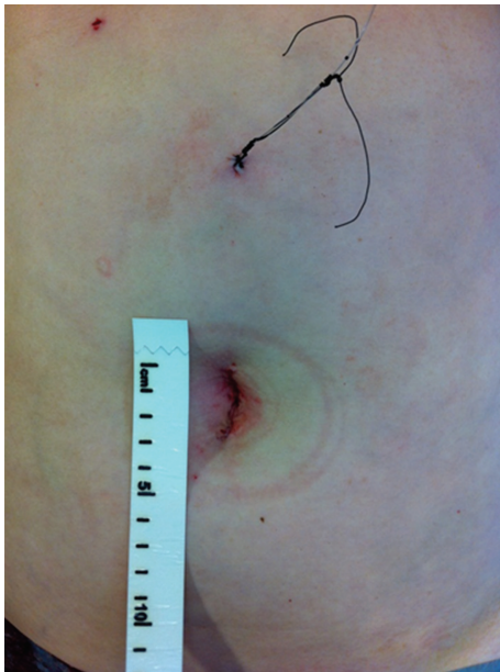
FIGURE 3: Operative photograph illustrating patient wound appearances at procedure end. The subcuticularly opposed 3 cm transumbilical wound is seen as the sole site of transabdominal access. The "Painbuster" infusional catheter is seen cephalad on the abdominal wall; this tunnelled catheter provides local anaesthesia by continual bupivacaine infusion for the first thirty hours postoperatively.

BMI: Body Mass Index; Postop: Postoperative; F: Female; M: Male; BSO: Bilateral Salphingo-oophorectomy; Abdo: Abdominal; RIF: Right iliac fossa; UTI: Urinary Tract Infection; TB: Tuberculosis.