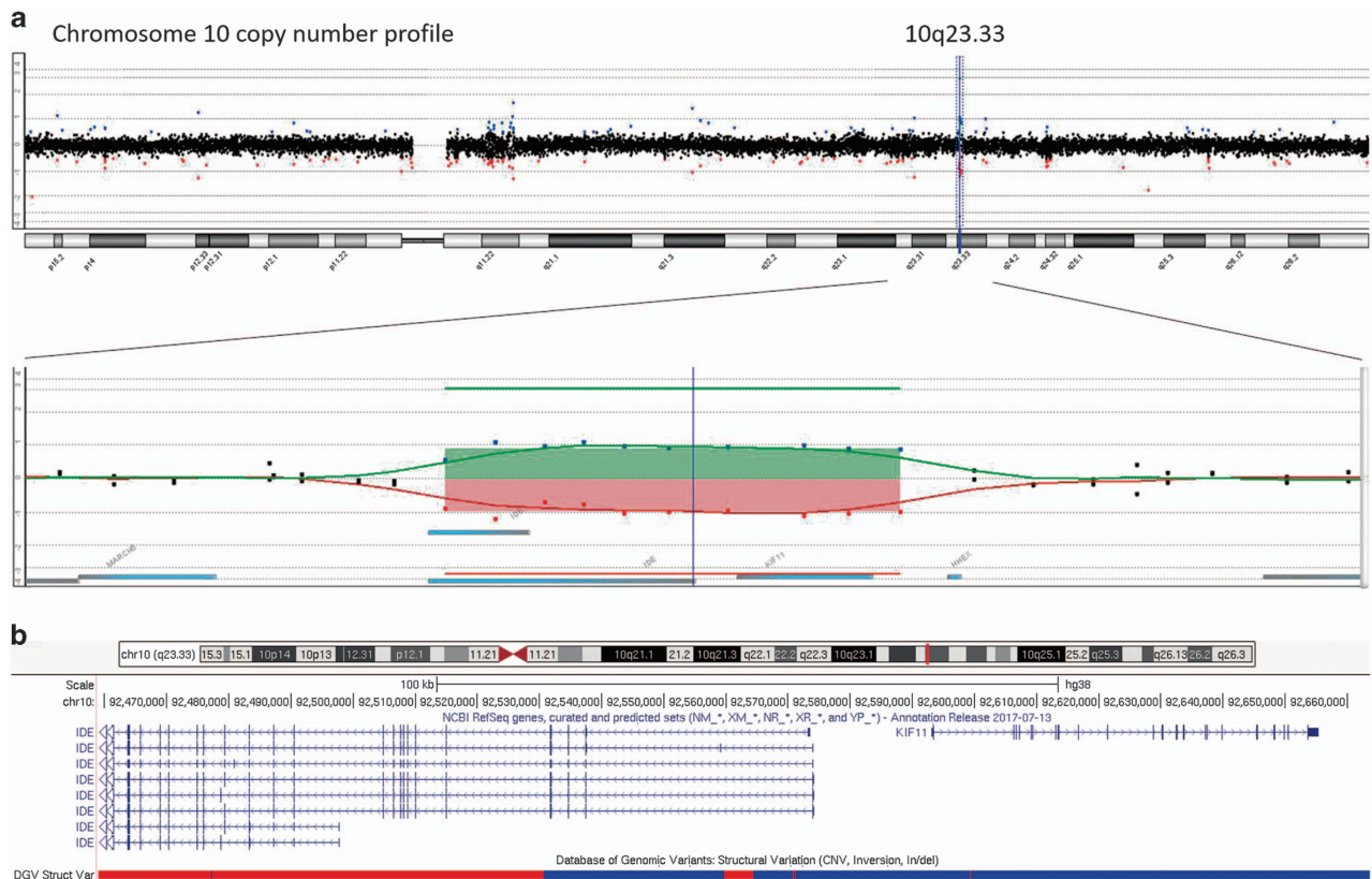
Figure 1. Microdeletion at 10q23.33 encompassing the KIF11 gene detected in the father and two children presenting microcephaly, mild intellectual disability and chorioretinopathy. The image shows the array comparative genomic hybridization (aCGH) profile of the deleted chromosomal segment at 10q23.33, encompassing the KIF11 . The upper panel (a) shows the entire chromosome 10 copy number profile with the deletion marked by a blue vertical line at 10q23.33; below, a closer view of the deleted segment, with superposition of two array-CGH experiments with dye swap (colored regions depicting the alteration); the blue bar at the right indicates the KIF11 gene location; images adapted from Genomic Workbench software (Agilent). The lower panel (b) depicts genomic features of the 10q23.33 deleted segment according to the array-CGH mapping (arr[hg38] 10q23.33(92,458,987_92,667,951)x1 (ISCN 2016)) —the curated isoforms of the two affected genes (NCBI Ref Seq genes track), part of IDE and the entire KIF11 , are shown as dark blue lines, in which the vertical bars denote exons; DGV gain and loss loci are shown as blue and red bars, respectively (images derived from the UCSC Genome Browser, freeze January 2018).

exposure of the sclera of both eyes (Figure 2b). The boy presented a symmetrical increase in vascular tortuosity and chorioretinal atrophy in the lower region of the retinal nerve fiber layer, adjacent to the optic disc (Figure 2c).