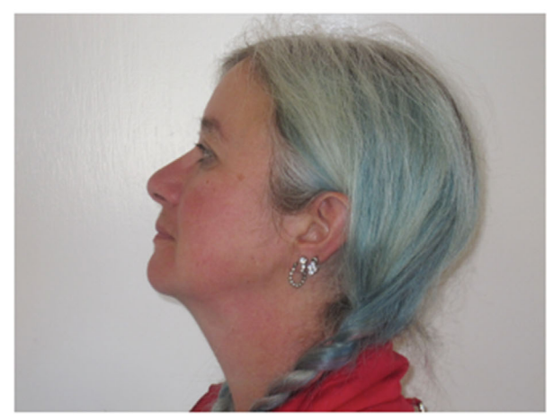
FIGURE 4 Patient 7 age 46 years demonstrating facial asymmetry, mild ptosis, and hypertrichosis

et al., 2016). However, there is clear heterogeneity of extracardiac connective tissue involvement. Joint hypermobility is a commonly described feature, however, does not necessarily equate to connective tissue disease. Other previously described features signifying possible connective tissue disease include high-arched palate and dislocatable joints (Caulfield et al., 2018). In our patient cohort, 7/14 (50%) had evidence of joint hypermobility, and 3/14 (21%) had high-arched palate, but all in the