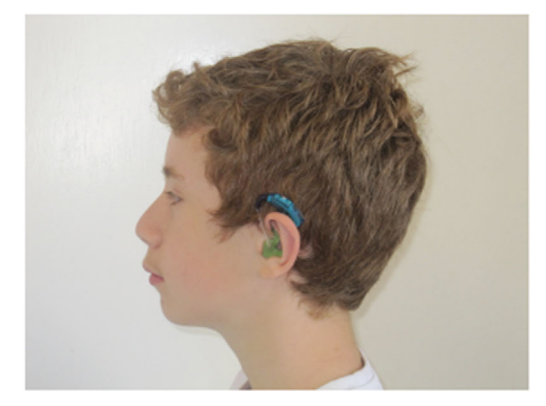
FIGURE 5 Patient 8 aged 12 years 6 months demonstrating facial dysmorphism including epicanthic folds and mild ptosis

Previously unreported feeding problems during infancy were seen in 5/14 (36%) of our patient cohort, mainly co-existing with hypotonia. Our cohort had higher incidence of hypotonia than published cumulative cohorts (Tables 2, 3). Musculoskeletal problems and soft, hyperextensible skin have been previously reported in TAB2, and described as partially comparable to an Ehlers-Danlos Syndrome phenotype (Ritelli et al., 2018). The skin of one patient had a soft and doughy texture, similar to what has been previously described in TAB2, but there were no other skin abnormalities identified. The range of skeletal abnormalities presented in our cohort were varied; delayed bone age, abnormalities of digits and clinodactyly, cubitus valgus, congenital dislocation of the hip, Perthe's disease, lumbar hyperlordosis and abnormal C3 and C4 vertebrae. One patient had pes planus explained by osseous and fibrocartilaginous coalition of the joints of the foot. In our cohort, 13/14 (92%) had failure to thrive (FTT) at some point during infancy, or had subsequent short stature, which is a higher incidence than previous reports.