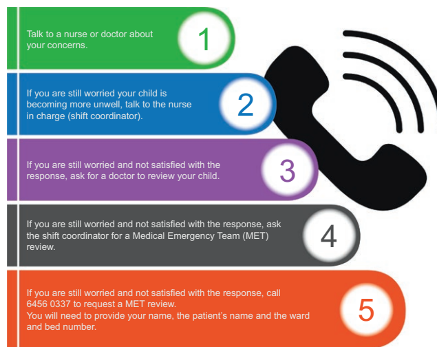
FIGURE 1 Calling for Help 5 steps

The study site is a specialist paediatric facility offering a full range of services to children from 0 to 16 years. A two-tiered Rapid Response System