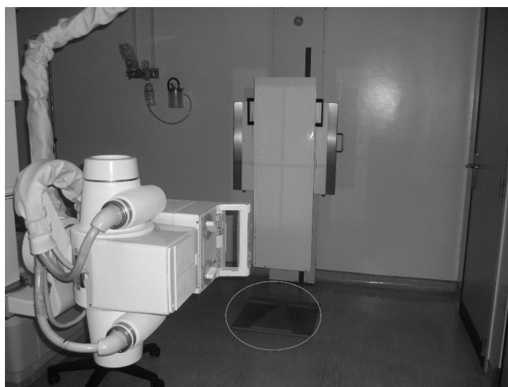
Figure 3. Philips X-ray machine with the wood base for the foot position.

After the visual scan assessment, the students were forwarded to a hospital for X-ray analysis. They were evaluated by a spine surgeon in a standing position for long radiographies, in the exact same position aforementioned, with the wood base for the foot position (Figure 3). A specialist medical doctor carried out blind evaluations with column radiographies with a Philips X-ray machine (Philips, System Medical - CYT9890, 010/87431 SN 14001512, Amsterdam). The evaluation permitted the assessment of neck, shoulders, scapulae, thoracic, and pelvic asymmetries.