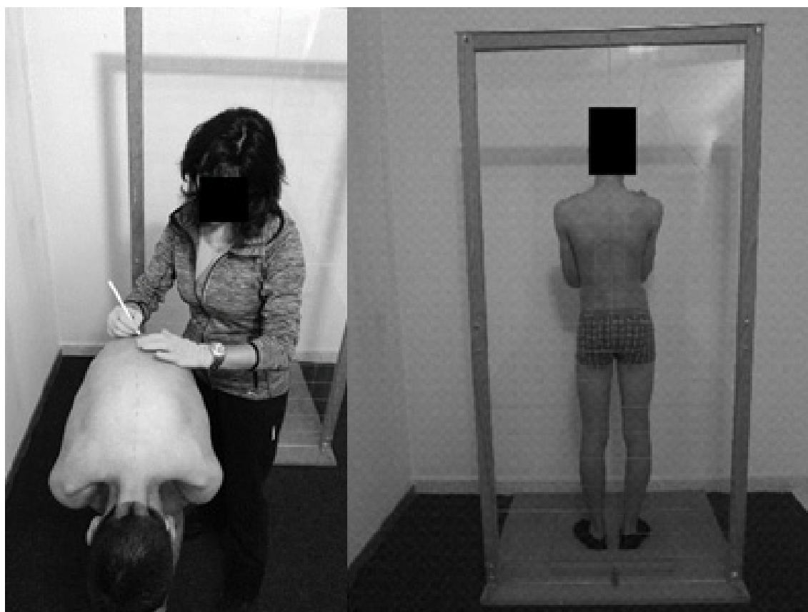
Figure 1. Left panel depicts the vertebrae marking process, the right panel depicts the visual evaluation.

The field test was conducted using an instrument designed and supported by the literature [20]. The instrument was based on a simetograph and adapted for this research. It consisted of an acrylic board supported by a wood base. On the base, there was a reference 0.6 m in length and 0.6 m in width for the foot position (with 30° of abduction) to avoid inter-student variability in foot position [21]. Each evaluated subject was positioned behind the transparent acrylic board with a 1.90 m height and 0.90 m width. In the upper part of the acrylic board was positioned a plumb line as a vertical reference. The acrylic board was marked with a two-dimensional grid using 0.1 m marked divisions in the vertical and horizontal directions. This instrument's setup allowed the researcher to control the student's overall position while performing the measurements. Indeed, this setup was used in both the field and clinical test to ensure a standardized measurement, and hence avoiding inter-student variability between tests. Students were placed in the orthostatic position, with both upper limbs crossed and hands touching the opposite shoulder (Figure 1, right panel).