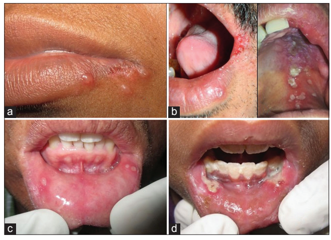
Figure 2: (a) Acute outbreak of clusters of herpetic vesicles; (b) unilateral presentation of vesicles on the left commissure of mouth and left half of palate associated with pain suggestive of herpes zoster; (c) aphthous ulcers; (d) Behcet's Syndrome-Recurrent multiple painful apthous ulceration of the oral cavity with genital ulcers

in origin, and may occur independently or precede cutaneous involvement.<sup>[14]</sup> We report 4 cases of erythema multiforme (EM) and a case of pemphigus vulgaris occuring in the oral cavity with no cutaneous involvement. Characteristic target lesions and edema of the lips were seen in EM. In another study conducted in an Indian population, a prevalence rate of 0.2% was observed, which was lower than that seen in the present study (1%).<sup>[7]</sup>