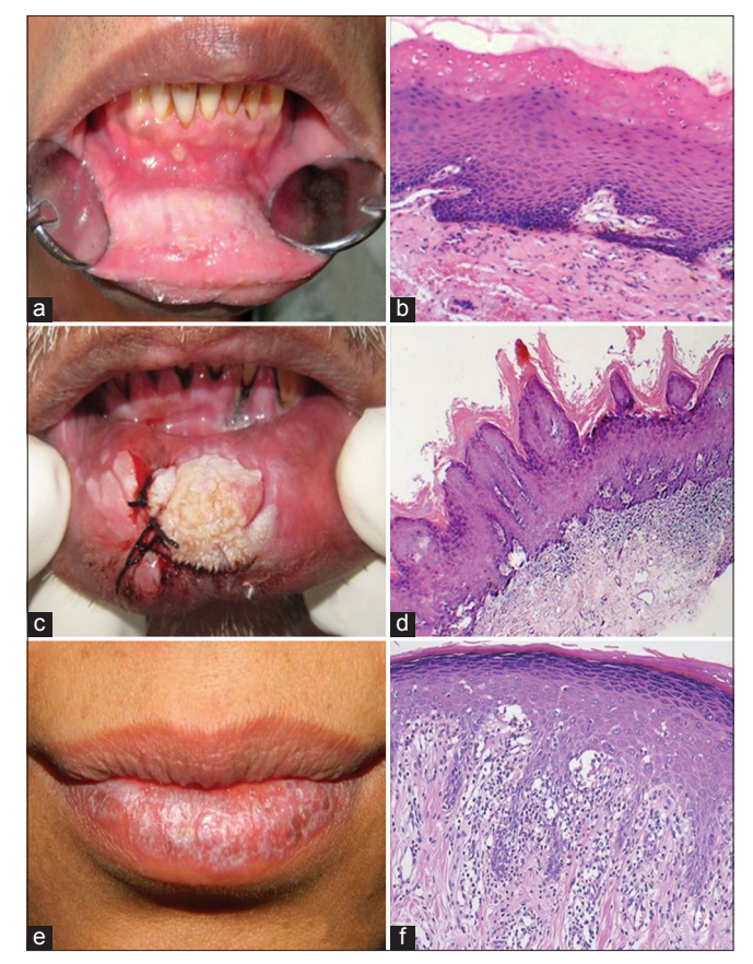
Figure 1: (a) Oral leukoplakia: A non-scrapable, fissured gray-white lesion; (b) parakeratotic hyperkeratosis with acanthosis (Hematoxylin and eosin; 100×); (c) verrucous hyperplasia; fissured gray-white lesion; (d) hyperplastic orthokeratinized squamous epithelium thrown into verrucous folds suggestive of verrucous hyperplasia. (Hematoxylin and eosin; 40×); (e) oral Lichen Planus; White reticular striae seen on lower lip; (f) basal cell layer degeneartion with sub-epithelial inflammatory cell infiltrate suggestive of lichen planus. (Hematoxylin and eosin; 100×)

Clinically, leukoplakia and OLP may sometimes resemble each other. Leukoplakia is a tobacco associated lesion, which clinically presents as a non-scrapable white patch, whereas OLP is an autoimmune, mucocutaneous disease with a bilateral occurrence clinically presenting as a white striation, papule, plaque, or erosion. [9] Population based studies from across the globe have shown that leukoplakias have a relatively high rate of malignant transformation because of its strong correlation with tobacco and alcohol use. [10] In the present study, incidence of smokeless tobacco was found to be higher as compared to smoked tobacco.