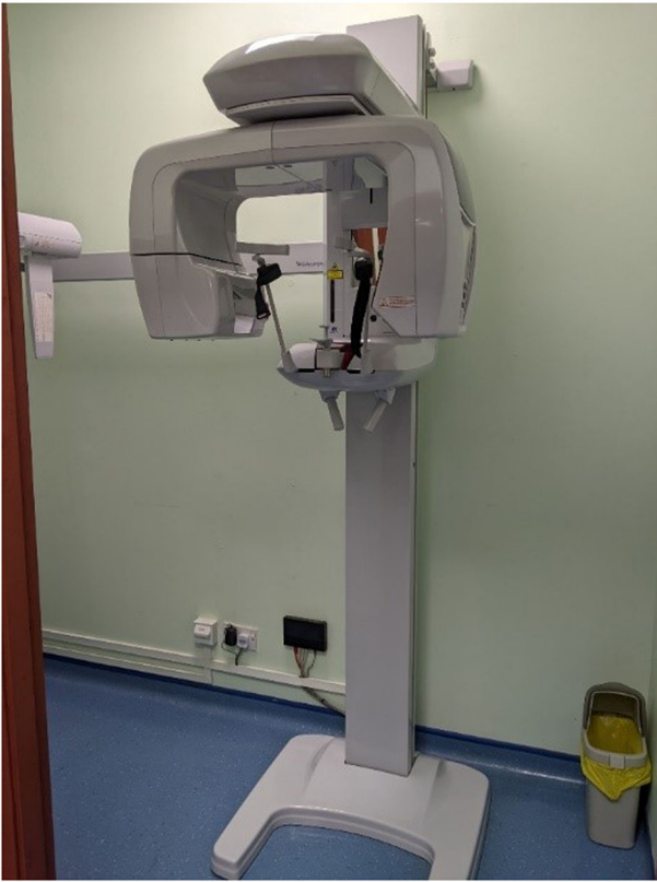
Fig. 1 CBCT scanner. CBCT scanner used in the study which is located in the National Dental Centre, Brunei Darussalam.