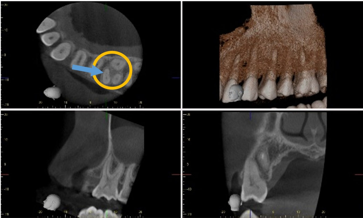
Fig. 3 CBCT scan of teeth in the upper left maxillary region. A distinct MB-2 canal (blue arrow) on an axial cross section of an upper first molar (yellow circle).

more statistically significance in the frequency of two apical foramina in ages between 20 and 50 compared to those aged 50 and above. Fusion of MB-2 canal and MB-1 canal was found more frequently with increasing age due to physiological calcification patterns of the pulp and narrowing of the canals via secondary dentine deposition [32]. This process could account for the significant reduction of two apical foramina in the age group >50 in the present study. However, the results should be interpreted with caution as our sample was small, and the range of ages did not spread extensively in the present study. There was no significant correlation of gender with the number of apical exits among MB-2 canals of both maxillary molars. To our knowledge, only one study was performed by Faraj [31] that investigated and showed non-significant association of gender and the number of MB-2 canal exits. The reasoning remains unclear to which whether gender affects the number of apical portals exits of MB-2 canals.