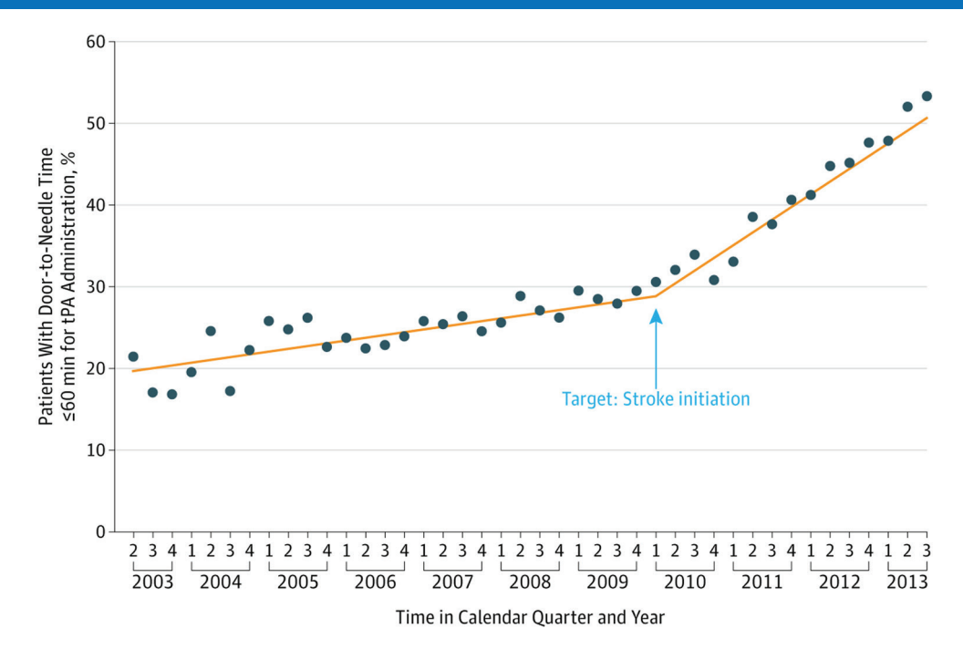
Figure 3 Impact of the Target: Stroke quality improvement initiative. Time trend in the proportion of patients with door-to-needle times for tPA ≤60 min during the preintervention and postintervention periods of Target: Stroke. Reproduced with permission from JAMA. 2014; 311(16):1632–1640. Copyright ©2014 American Medical Association. All rights reserved. tPA, tissue plasminogen activator.

care improved across black, white and Hispanic patients after GWTG implementation, although black patients are still less likely than white or Hispanic patients to receive evidence-based care. Several studies have examined persistent disparities in race/ethnicity, age, sex and socioeconomic status that must be addressed. Studies have also found variation in care according to hospital region, time of presentation and stroke subtype. A recent study found that despite the regional variability of healthcare resources available for acute stroke treatment, quality of care and inhospital outcomes in GWTG hospitals did not differ by regional resource availability.