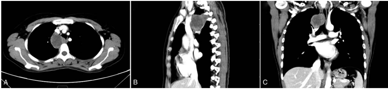
Figure 1. Contrast-enhanced computed tomography of the chest reveals a well-defined mass in the right posterior mediastinum: axial (A), sagittal (B), and coronal (C) reconstructions.