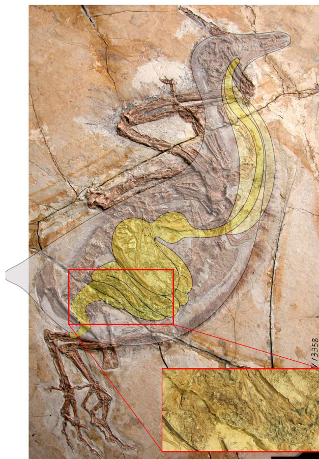
Figure 4. Interpretative drawing of the alimentary canal of Yanornis superimposed over IVPP V13558. Enlarged red box shows preservation of sand compacted in the intestines. The grit is clearly too caudally located to represent gizzard stones. The oesophagus is drawn in a way to demonstrate its flexibility; it leads to the small proventriculus (pyloric sphincter indicated by dashed circle), followed by the larger ventriculus, and then the intestines and cloaca. Scale bar equals 1 cm.