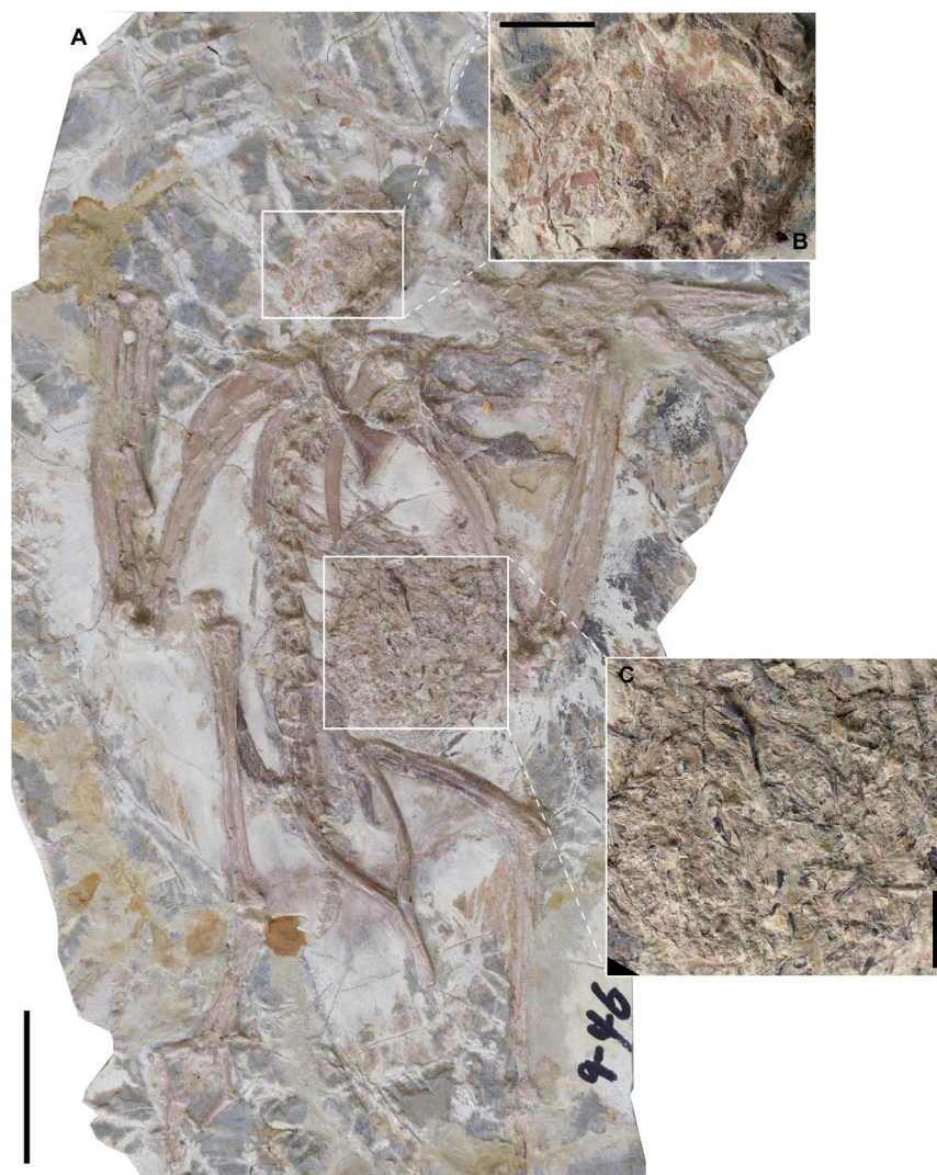
Figure 2. Yanornis STM9-46 preserving macerated fish bones in the crop and ventriculus: (A) full slab, scale bar equals four cm; (B) detail of the crop, scale bar equals one cm; (C) detail of the ventriculus, scale bar equals one mm. doi:10.1371/journal.pone.0095036.g002

several of these are related to the loss of teeth [10]. The basal ornithuromorph Archaeorhynchus is edentulous, possessing several morphological indicators of herbivory, and also preserves geogastrolith gizzard stones in all specimens [3,14], thus direct evidence and morphological indicators concur. However, most Yanornis specimens preserve fish remains and do not preserve gastroliths, although two specimens do preserve the latter feature (IVPP V13558, STM9-51). Furthermore, morphological indicators for herbivory are absent; Yanornis possesses the most robust, sectorial dentition of any Early Cretaceous ornithuromorph and a greater number of teeth than any Early Cretaceous bird. Furthermore, in light of new comparative material, the gastroliths preserved in Yanornis show some peculiarities. In specimens of Archaeorhynchus the gizzard stones are all similar in size (2 mm), whereas in IVPP V13558 the stones range from 0.2–2.7 mm, and a large number of them are smaller than the gizzard stones preserved in Hongshanornis (~1 mm), a much smaller taxon [7]. The stones are also far more numerous in IVPP V13558. While nearly every other specimen with gastroliths is preserved in dorsoventral view, showing a small, dense, round mass of stones