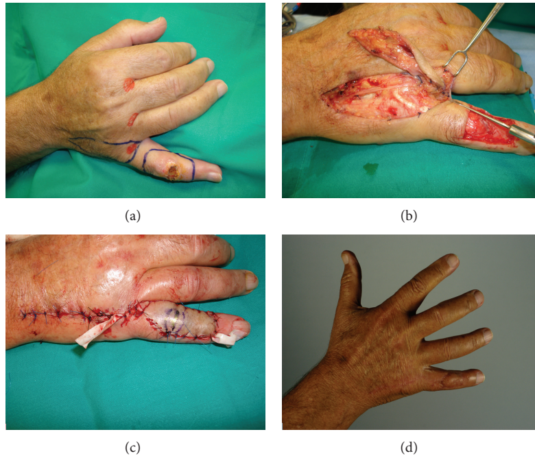
FIGURE 2: (a) Squamous cell carcinoma of the dorsal aspect of the little finger. Excision and reconstruction with a perforator propeller flap was planned. (b) Dissection view of the flap. (c) Immediate postoperative result. (d) Final result.

an example of the degree of customization provided by these flaps. While we used to harvest musculocutaneous flaps in the past, to warrant vascular supply to the skin, now we moved to cutaneous-muscular flaps, where only the portion of muscle needed for the reconstruction (and not as a vehicle for the vessels) is taken with the flap. This optimizes outcomes at the recipient site and minimizes morbidity.