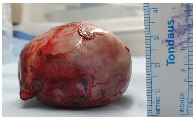
Fig. 2. Gross appearance of the resected mass.

To determine the genetic etiology of ACC, targeted next generation sequencing was performed to identify genetic defects.