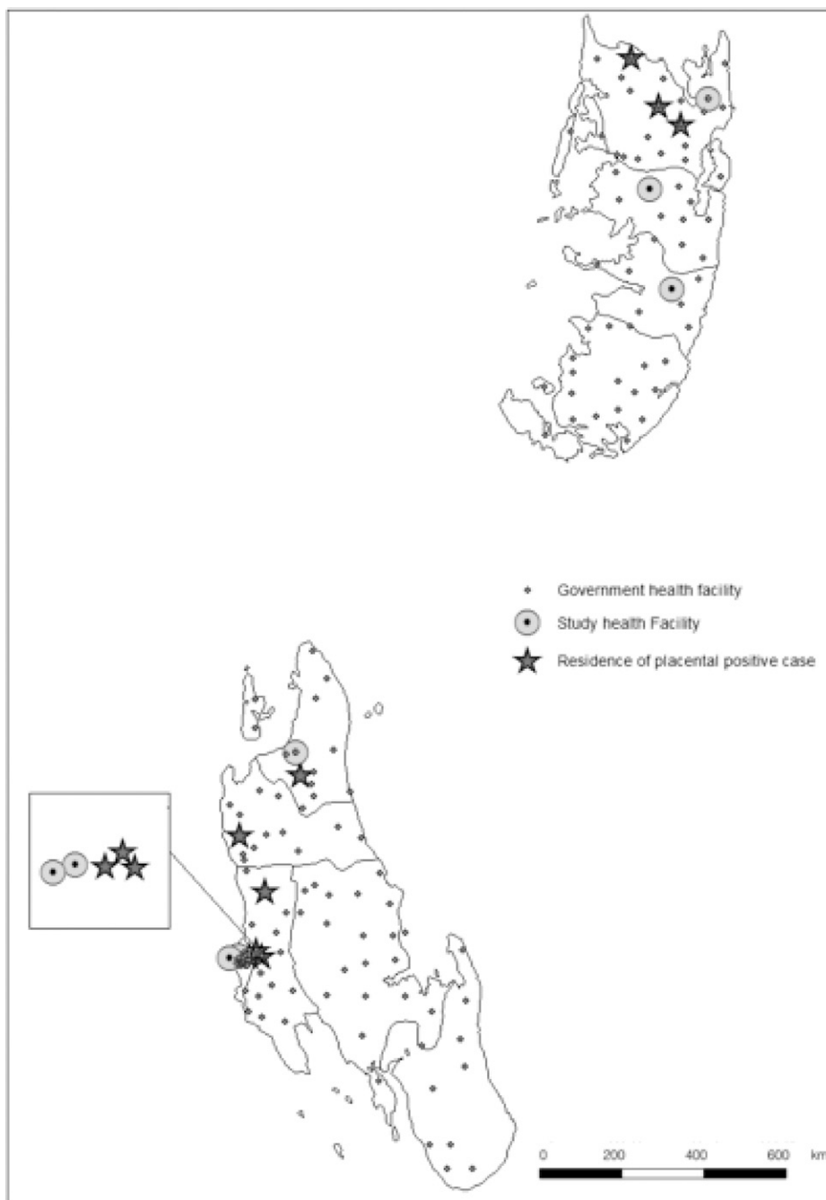
FIGURE 2. Placental malaria infection cases in Pemba and Unguja, Zanzibar.

maintained of women who were not enrolled, to minimize the study-associated workload among busy labor/delivery ward staff, the exact number of eligible women remains uncertain. However, failure to enroll eligible women was likely related to the workload at the time that the woman presented, which is unlikely to be related to the outcome of interest. This limitation did not likely compromise the generalizability of our results to all pregnant women who did not receive IPTp delivering at these facilities. Because the facilities were selected purposively from the facilities supported by a USAID-funded program designed to improve maternal and newborn health services, the generalizability of the findings to all pregnant women who deliver at health facilities in Zanzibar cannot be