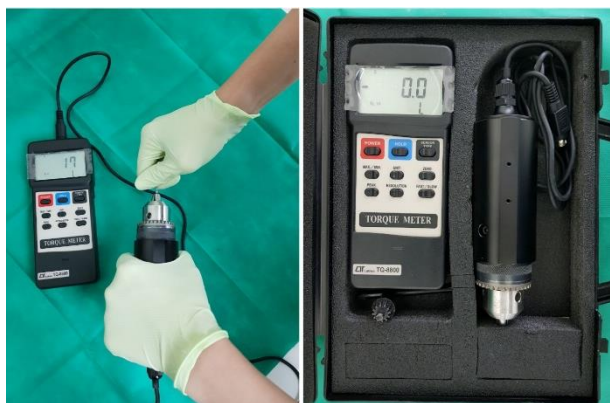
Figure 1. The maximum hand-generated torque for tightening of abutment screws by professors and postgraduate dental students was measured with the use of a digital torque meter (Iotron, TQ8800, Taiwan) accurate to 0.1 N/cm.