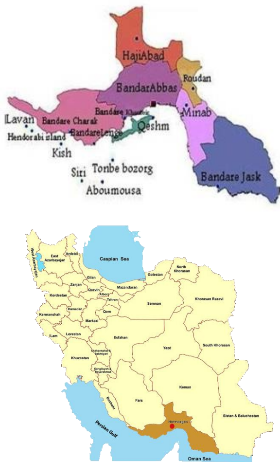
Figure 1 - Location of BandarAbbas in the map of Iran