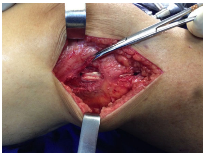
Figure 4. Lateral view of the right knee showing the final appearance of the anterolateral ligament reconstruction, which is already fixed into the femur and tibia, passing under the iliotibial band to respect its anatomic path.

created with a 7-mm drill. An allograft semitendinosus tendon from our institution's tissue bank was used as a graft, and fixation was performed at 30° of flexion and neutral rotation with absorbable 7 × 25-mm interference screws (Smith & Nephew) (Figures 3 and 4). The allograft was chosen because, despite being a low-morbidity solution, we did not want to harvest either the iliotibial band or the contralateral side. After the ALL reconstruction was performed, repeat clinical examination revealed that the preoperative pivot glide had been abolished (see the Video Supplement).