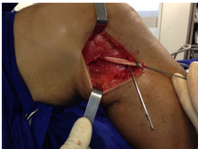
Figure 3. Lateral view of the right knee showing the extra-articular reconstruction of the anterolateral ligament. The graft is already fixed into the femur and is going in an antero-inferior direction until its tibial insertion between the Gerdy tubercle and the fibular head.