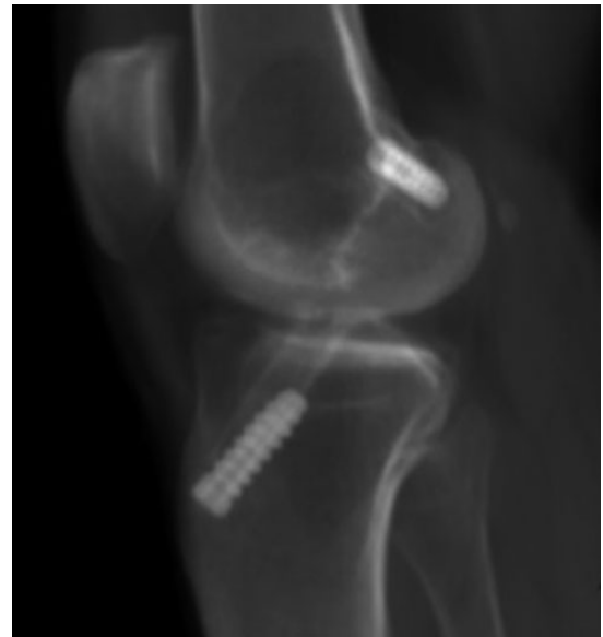
Figure 2. Lateral radiographic knee view showing the anterior cruciate ligament tunnels and the metal screws used for graft fixation. The femoral tunnel was performed close to the anteromedial bundle position.

associated lesions were found. For the ALL reconstruction, a lateral incision was made in line with the iliotibial band, and a femoral tunnel on the posterior border of the lateral epicondyle and a tibial tunnel between the Gerdy tubercle and the fibular head (7 mm distal to the lateral tibial plateau) were