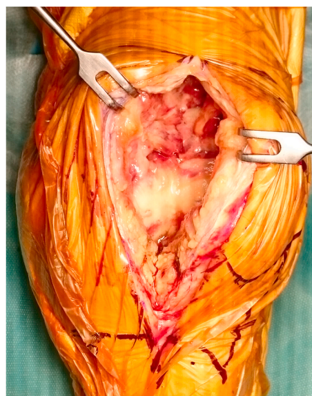
Fig. 3. Surgical findings. The synovium was hypertrophic because of inflammatory changes and the suprapatellar sac contained granulation tissues.