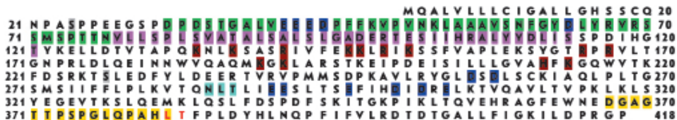
Fig. 1. Amino acid sequence of the PEDF protein. The bond Leu382-Thr383 is marked in bold red. Yellow highlights mark the serpine loop, and light blue marks the N-glycosylation site. Green – peptide responsible for the antiangiogenic function; pink – peptide responsible for the neurotrophic function. Grey – phosphorylation sites. Blue – cluster of negatively charged amino acids, brown – positively charged amino acids.

and actual masses of the factor [12]. According to 2D electrophoresis data, human PEDF secreted by pigment epithelium cells has 4 isoforms, whose isoelectric points are 6.0; 6.2; 6.4 and 6.6 [13].