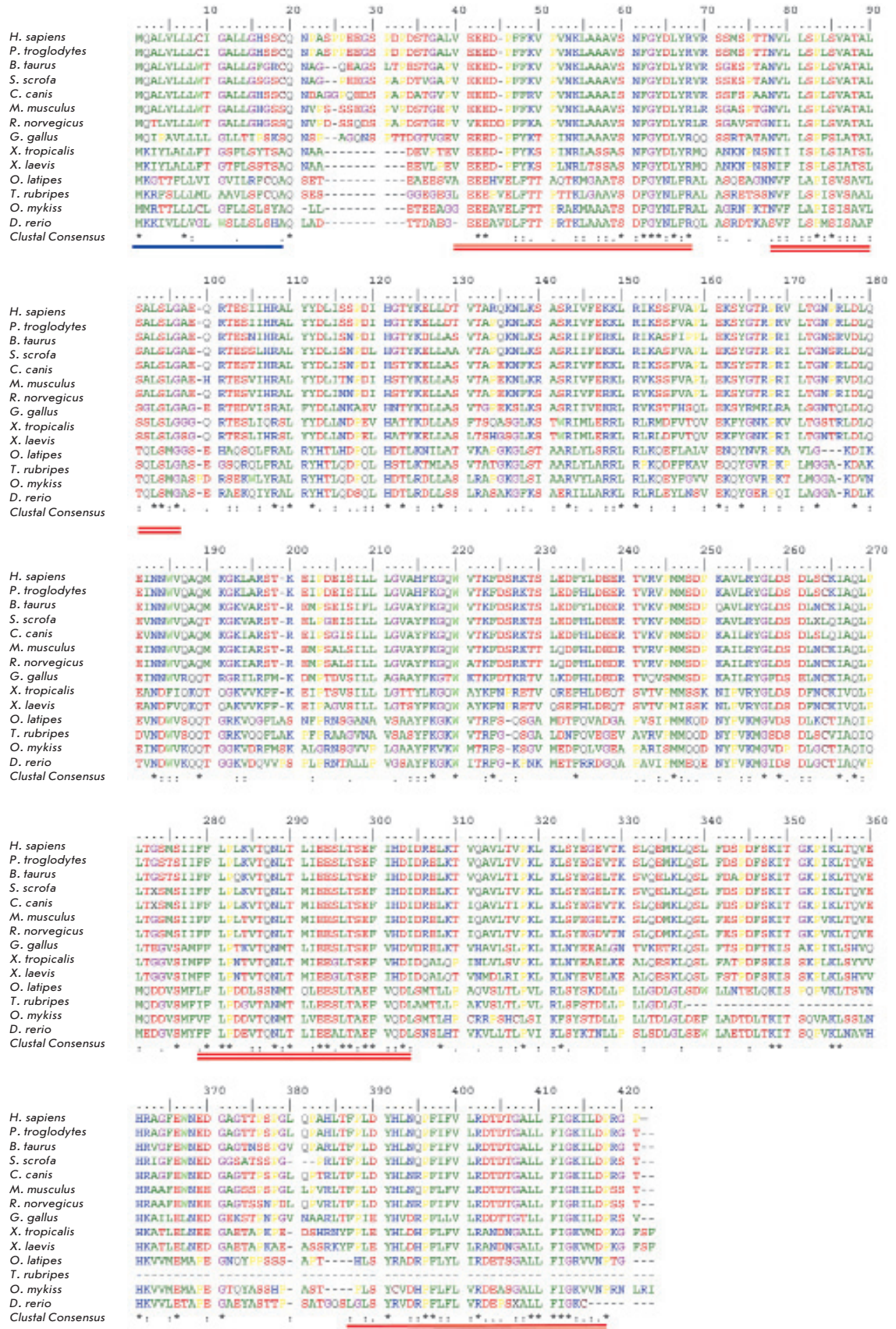
Fig. 4. Comparison of the amino acid sequences of PEDF proteins of different origins. 14 sequences of the factor from different biological species (human, Homo sapiens ; chimpanzee, Pan troglodytes ; domestic cow, Bos taurus ; pig, Sus scrofa ; dog, Canis canis ; mouse, Mus musculus ; rat, Rattus norvegicus ; chicken, Gallus gallus ; Western clawed frog, Xenopus tropicalis ; African clawed frog, Xenopus laevis ; Japanese ricefish, Oryzias latipes ; rainbow trout, Oncorhynchus mykiss ; zebra fish, Danio rerio ) were analyzed using ClustalW software. Asterisks mark the positions of fully conserved residues. Colons indicate that a "strong" functional group is conserved; periods indicate that a "weak" group is conserved. The blue line marks the PEDF leader sequence. The double red line marks regions that are highly conserved in all the PEDF sequences. Dashes are used for the maximal alignment of the sequences [16].