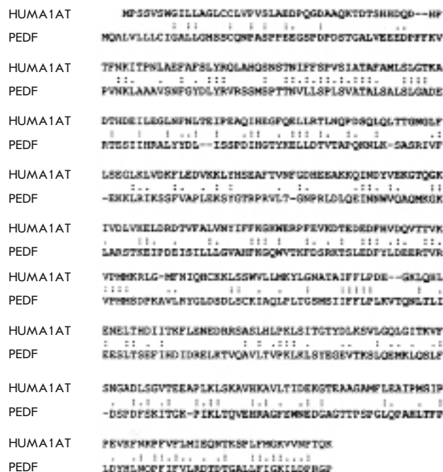
Fig. 2. Comparison of the amino acid sequences of human PEDF and \alpha 1-antitrypsin (HUMA1AT). Colons (:) depict identical amino acids, and periods depict conserved substitutions [3].

After the release of the 36-a.a. fragment, the general ellipticity of the molecule is reduced, indicating that the molecule experiences a reduction in the \alpha -helix structure. Unlike inhibitory serpines, this process lowers the thermal stability of the PEDF molecule. However, these conformational alterations are not widespread and involve only the C-terminal region located near the exposed loop. The functional role of the latter and the