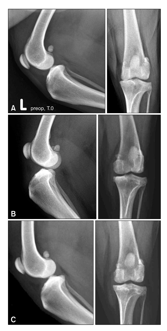
Fig. 3. Dog No. 2. Caudocranial (right panel) and lateromedial (left panel) radiographs were taken preoperatively (A), 3 (B), and 12 months (C) after surgery. Mild signs of osteoarthritis (OA) at each time point.