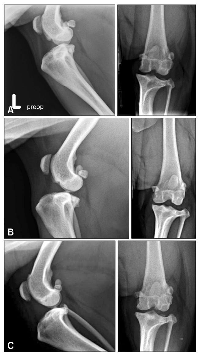
Fig. 4. Dog No. 4. Preoperative X-rays (A) evaluated signs of OA, including the presence of osteophytes, effusion synovial, and subchondral bone sclerosis. At 3 (B) and 12 months (C), there were signs of slow OA progression. Right panel: caudocranial view, left panel: lateromedial view.

Extracapsular surgical methods performed for stabilization of the stifle joint aim to restore the functions of the ligament without its anatomical replacement. Further, these surgical