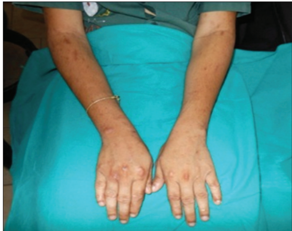
Figure 3: Hyperpigmented and verrucous surface skin over both the elbows, knuckles, sides of fingers