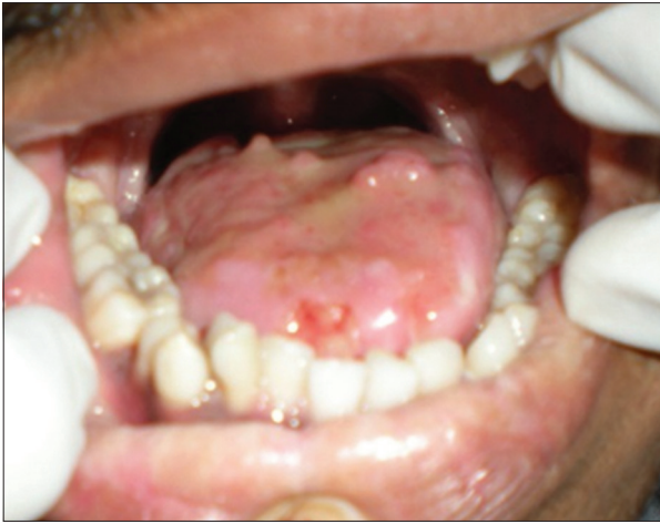
Figure 1: Multiple ulcerations on the dorsum of the tongue