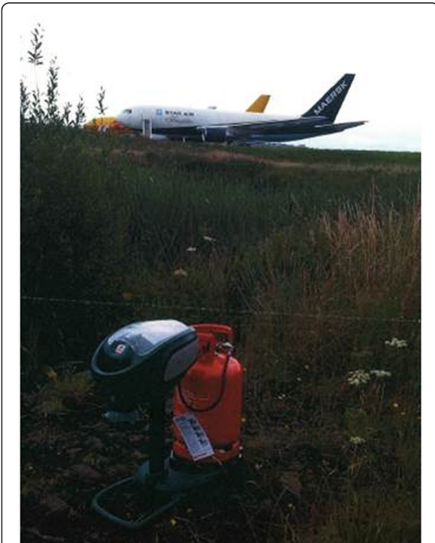
Fig. 3 Photograph of Mosquito Magnet at an airport

The port mosquito survey was started in 2010 and where possible mosquito surveillance continued over the subsequent years. No invasive mosquitoes have so far been recorded, and of the six native species that were recorded during the intensive survey in 2010, all are widespread and abundant throughout the majority of the UK ( Culex pipiens s.l., Anopheles claviger , Culiseta annulata , Anopheles maculipennis s.l., Ochlerotatus detritus , and Coquilletidia richiardii ). The main aim of the project was to facilitate each PHO to identify the optimal surveillance technique for their seaport / airport, particularly regarding operationally intensive areas surrounding aircraft and container movements (Fig. 5). BG Sentinel traps provided a useful and efficient method of monitoring adult mosquitoes in sheltered areas such as imported goods warehouses, with ovitraps used in key locations around cargo areas. Mosquito Magnets continue to be used at Liverpool seaport, and BG Sentinels have also had further use at Felixstowe Border Inspection Post (BIP) where food and other produce imports are inspected. The project identified a number of key areas where further efforts are required including: a focus on the importation of used tyres and development of a database that tracks the movement of these goods;