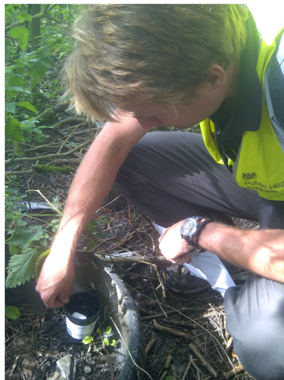
Fig. 7 Photograph of an ovitrapp at a motorway service station.

UK ferry ports are not considered to be appropriate for mosquito surveillance, given that vehicles exiting ferries or Eurotunnel are not required to stop for any significant period of time. Therefore focus has been given to motorway service stations along the inland routes from the ferry ports in southern England and Eurotunnel terminals. Invasive mosquito surveillance was therefore initiated by PHE at six service stations in the UK from August to October 2014 (Fig. 2; Tables 1 and 2). They were all chosen based on their proximity to cross-channel connections, and because they served traffic having recently arrived through the Eurotunnel and cross-channel ferry ports. A total of 56 ovitraps (Fig. 7) were set out across the six service stations from August to October, in vegetation around the car, caravan, and lorry parking areas. At three services stations, BG Sentinel adult traps were deployed using Sweetscent® lures. The ovitraps and adult traps were checked every two weeks until the second week of October. The substrate used in the ovitraps, cubes of polystyrene (~5 cm 3 ), were visually checked for eggs,