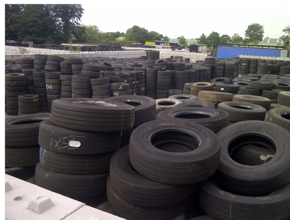
Fig. 6 Photograph of used tyres stored at a retreaded tyre manufacturer

Surveillance for invasive mosquitoes has also been conducted by PHE at several major used tyre importers annually since 2010 (Tables 1 and 2; Fig. 6). An initial search of imported tyre companies was conducted by systematically identifying tyre importers via internet and telephone book searches, existing databases and reports. HM Customs data was available for the years 2009–2012