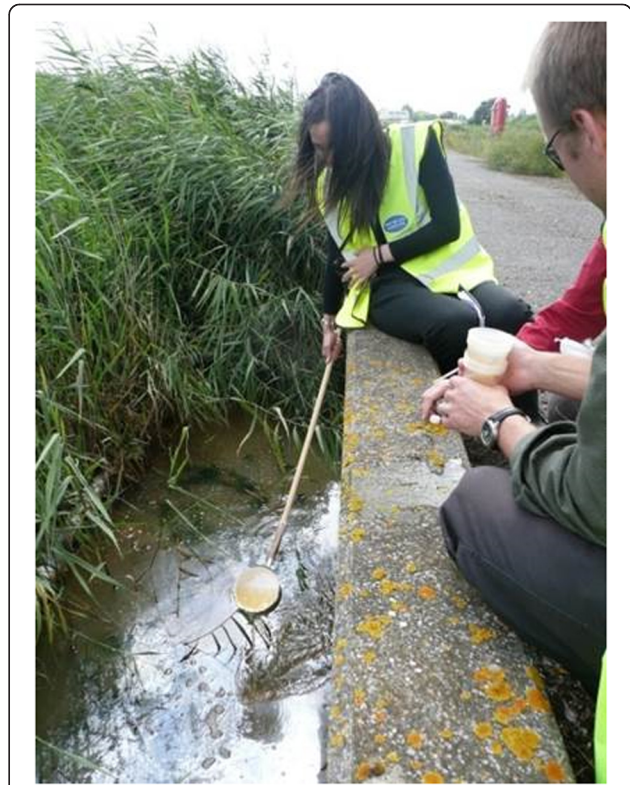
Fig. 4 Photograph of larval surveys at London Heathrow airport