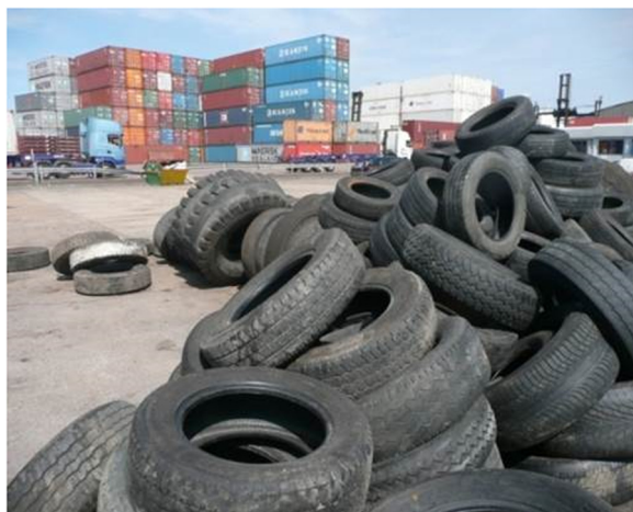
Fig. 5 Photograph of used tyres at a seaport

continued reporting of nuisance biting to the Mosquito Recording Scheme; and capacity building to apply control regimes in the event of finding an invasive species.