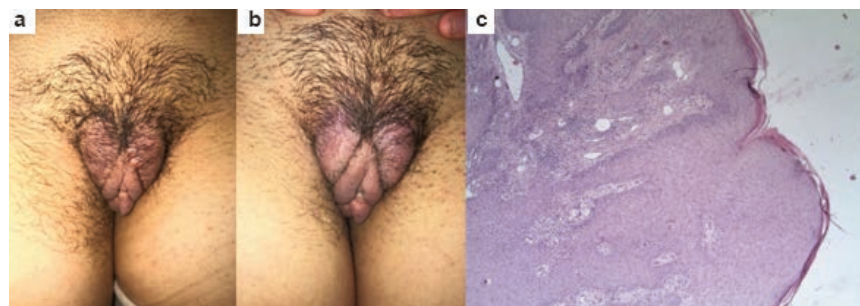
Figure 1. (a) Verrucous lesions up to 0.5 cm in diameter. (b) Regression of the lesions after the treatment. (c) Histopathological findings (HE, 40x). Acanthosis, koilocytosis, papillomatosis, macrophage and lymphocyte infiltration with plasma cells and eosinophilic granulocytes in the dermis and no signs of dysplasia.

BLT is known to manifest not only in sexually active people and adolescents exposed to violence or drugs, but also in people who do not have any predisposing factors or bad habits. Several studies have shown that in the majority of children with anogenital warts, HPV can be transmitted asexually by hetero-inoculation (e.g. from