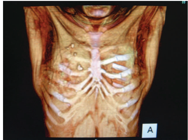
Fig. 1. There are deformations of both breasts and some residual foreign bodies in the chest.

The excised masses comprised liquid silicone; they were thought to have moved through the loose