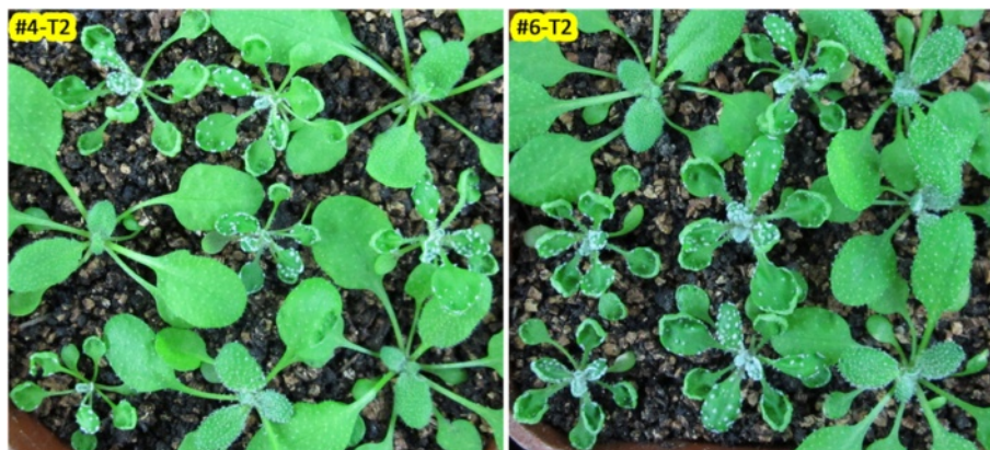
Fig. 2 Phenotypic segregation of T2 transgenic lines. Phenotypic segregation of T2 transgenic lines derived from two representative T1 lines with normal phenotypes. Seeds from T0 plants were sown on MS medium containing 25 mg/L hygromycin, vernalized at 4 °C for 3 days, and grown under long-day conditions (16 h light/8 h dark) at 22 °C for 7 days. Hygromycin-resistant seedlings (T1) were transplanted to soil and allowed to grow for 20 days before photographing

phenotypes (Table 3). We also sequenced their likely triple mutant T2 progeny (10 T2 plants per line; Table 3). The sequencing results revealed that the two T1 lines were mosaic with different degrees of mutation in the three target genes, demonstrating that the mutation frequency of a single gene in the T1 population was much higher than the frequency of simultaneous mutations of all three target genes. The formation of mosaic plants could be attributed to Cas9 mRNA and protein stability (Additional file 2: Table S2). For example, for a two- or four-celled embryo derived from a zygote that had undergone two or three rounds of mitosis, each of the two or four cells would contain three-quarters or half the amount of Cas9 protein of that in the egg cell (if Cas9 mRNA and protein were sufficiently stable; Additional file 2: Table S2). Two types of mosaic plants resulted from EC1.2p: Cas9 transformation: mosaics with a wild-type allele of a target gene and mosaics without wild-type alleles, which could be regarded as homozygous mutants. Analysis of the mutations present in the T2 progeny of the T1 mosaic plants demonstrated that most of the triple-mutant-like T2 plants were homozygous or biallelic triple mutants (Table 3).