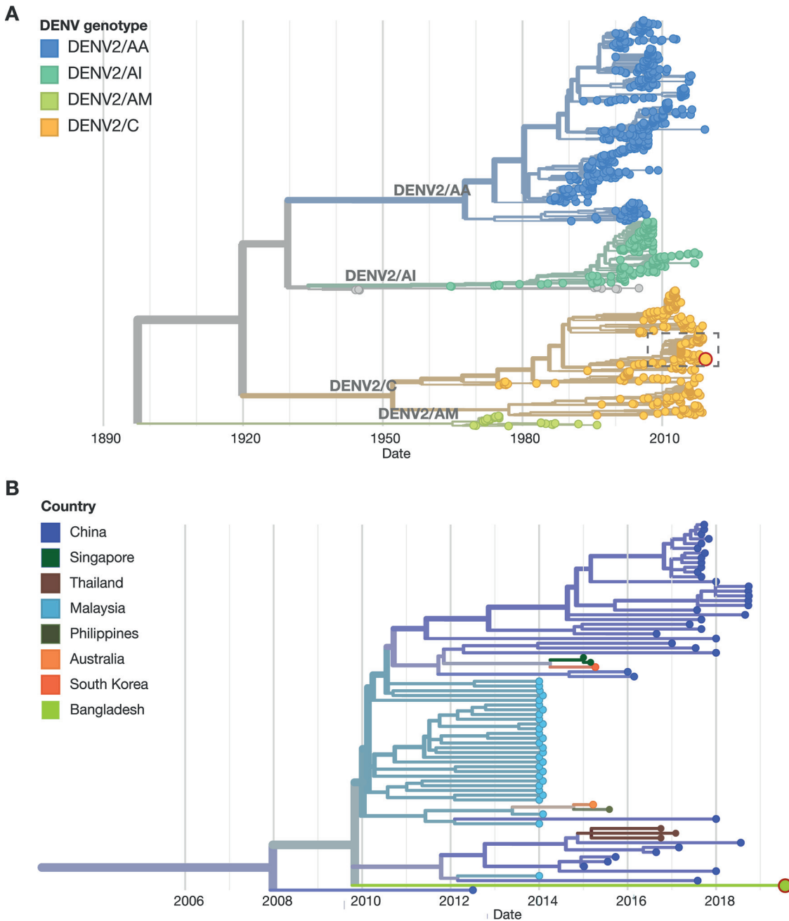
FIG 1 Phylogenetic trees of dengue virus serotype 2 (DENV2) strains rendered using Nextstrain. (A) Phylogenetic tree of CHRF_DenV002 (GenBank accession no. MN328061 ) contextualized with 1,202 dengue virus serotype 2 genomes available on Nextstrain. The circle bordered in red represents the position of CHRF_DenV002 in the tree. (B) Phylogenetic tree of CHRF_DenV002 contextualized with the closest genomes sequenced from Southeast and East Asian countries (access date, 18 October 2020).

matched reads and their relative abundance were calculated and mapped at the genus level and visualized.