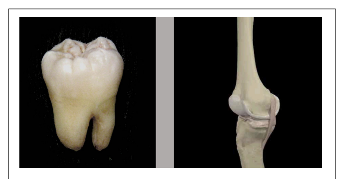
FIGURE 1 | An example of a picture of a tooth (Left) and paired picture (Right) used in the dot-probe task.

The task was presented in four blocks: one practice block and three experimental blocks. The practice block consisted of ten trials. The presented pictures in this block were landscape pictures and were only used in the practice trials. The experimental blocks consisted of 80 trials for happy/neutral, 80