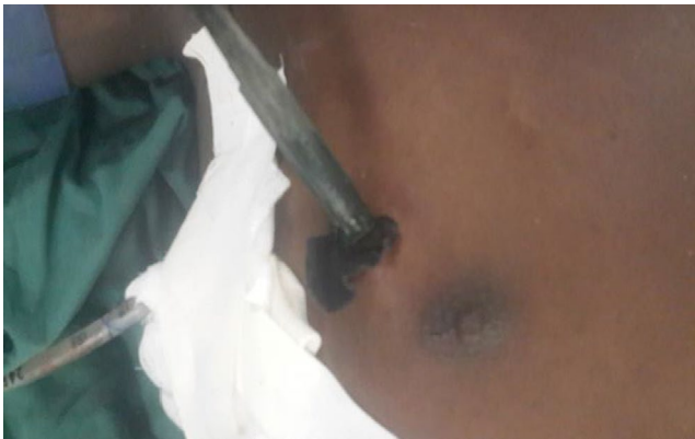
FIGURE 1 The spear piercing the right fourth intercostal space in the direction of the abdomen. Part of the shaft of the spear is visible outside the chest wall. Tubing of the intercostal chest drain is visible

The patient was admitted into the high dependency unit (HDU) for combined care before theater. Intravenous Ringer's lactate, Ceftriaxone 1 g daily, and Metronidazole 500 mg 8 hourly were commenced. A nasogastric tube (NGT) for free drainage and a transurethral catheter for monitoring urine output were inserted. The abnormalities on laboratory investigations were a low hemoglobin of 9 g/dL, elevated white cell count of 13 \times 10^9 Cells/L, and an elevated urea of 12 mmol/L. Since computed tomography (CT) scan and video-assisted thoracoscopic surgery (VATS) services were unavailable, we managed the case with X-rays and open surgery. The X-rays helped us to see the spear in relation to vital structures (Figure 2A,B).