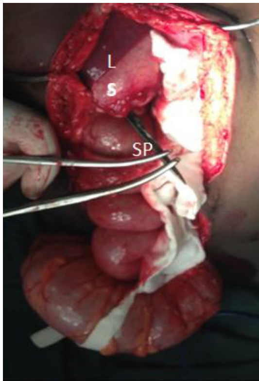
FIGURE 3 The spear piercing the liver and stomach and being retrieved antegrade. L, liver; S, stomach, SP, spear

A repeat check X-ray showed good lung expansion, and on day 4, the ICD was removed. On day 4, the patient was commenced on light diet and discharged to a general surgical ward. On day 7, the patient was discharged home. Five months after the operation, the patient is well and has no new complaints.