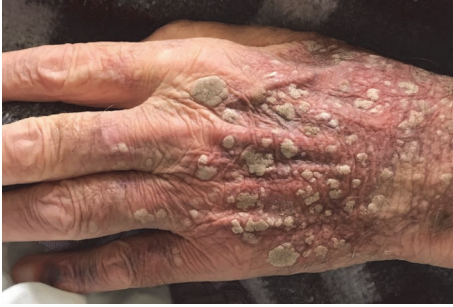
FIGURE 1: Seborrheic keratoses on the back of the hand.