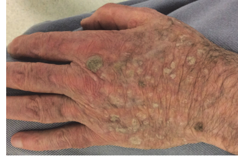
FIGURE 3: Remaining lesions on the back of the hand nine months after the start of the treatment.

Due to an incomplete stabilization of the pulmonary condition, the patient was discharged and returned after a month for cystoscopy and transurethral resection of the bladder tumor. Histopathological examination of the removed tissue confirmed a noninvasive low grade papillary urothelial carcinoma. Control cystoscopy did not show any residual mass. Adjuvant therapy with intravesical BCG administration was then commenced.