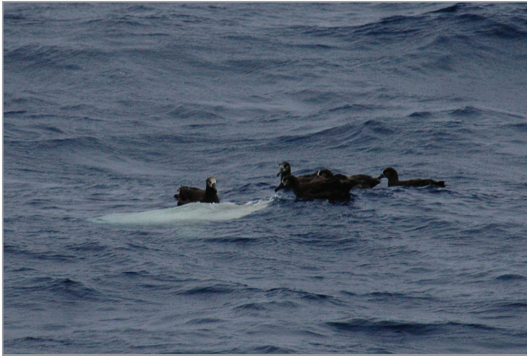
Figure 4. Next to black-footed albatrosses Phoebastria immutabilis , the large ocean sunfish was laying and showing its body.

on the T/S Oshoro Maru in the summer 2010 and 2011 cruises, for their endless