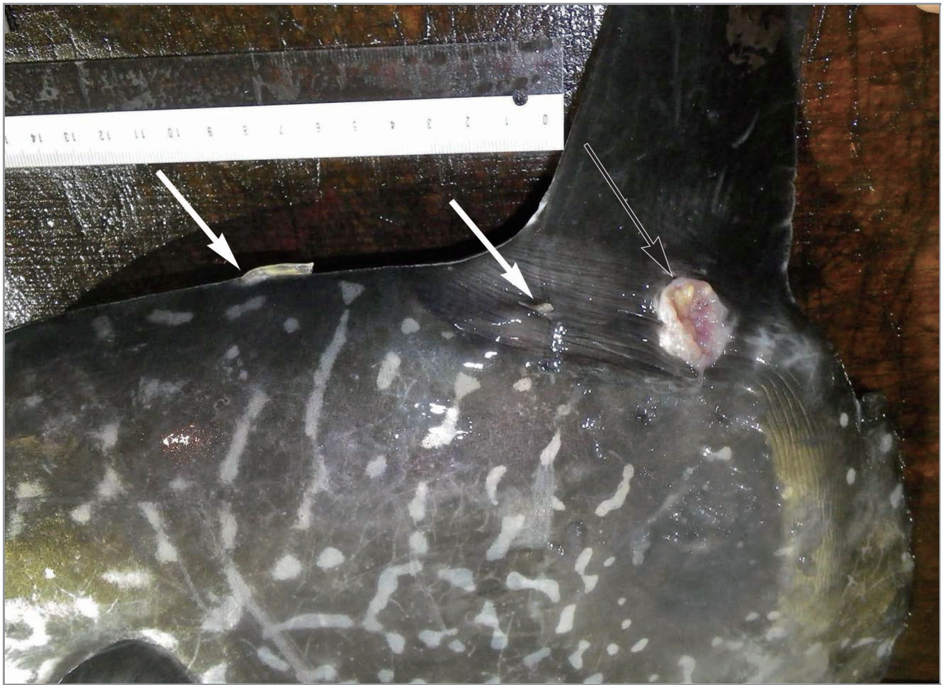
Figure 3. An ocean sunfish with half-removed Pennella sp. (pointed by white and black arrows) and heavily damaged skin (pointed by black arrow).

Çiçek et al. 21 ). Another scar in Figure 2 (denoted by a black arrow) seemed like a bad inflammation, maybe from Pennella parasites. Doi et al. 22 reported that this kind of damaged tissue, caused by Pennellid species, would recover quickly.