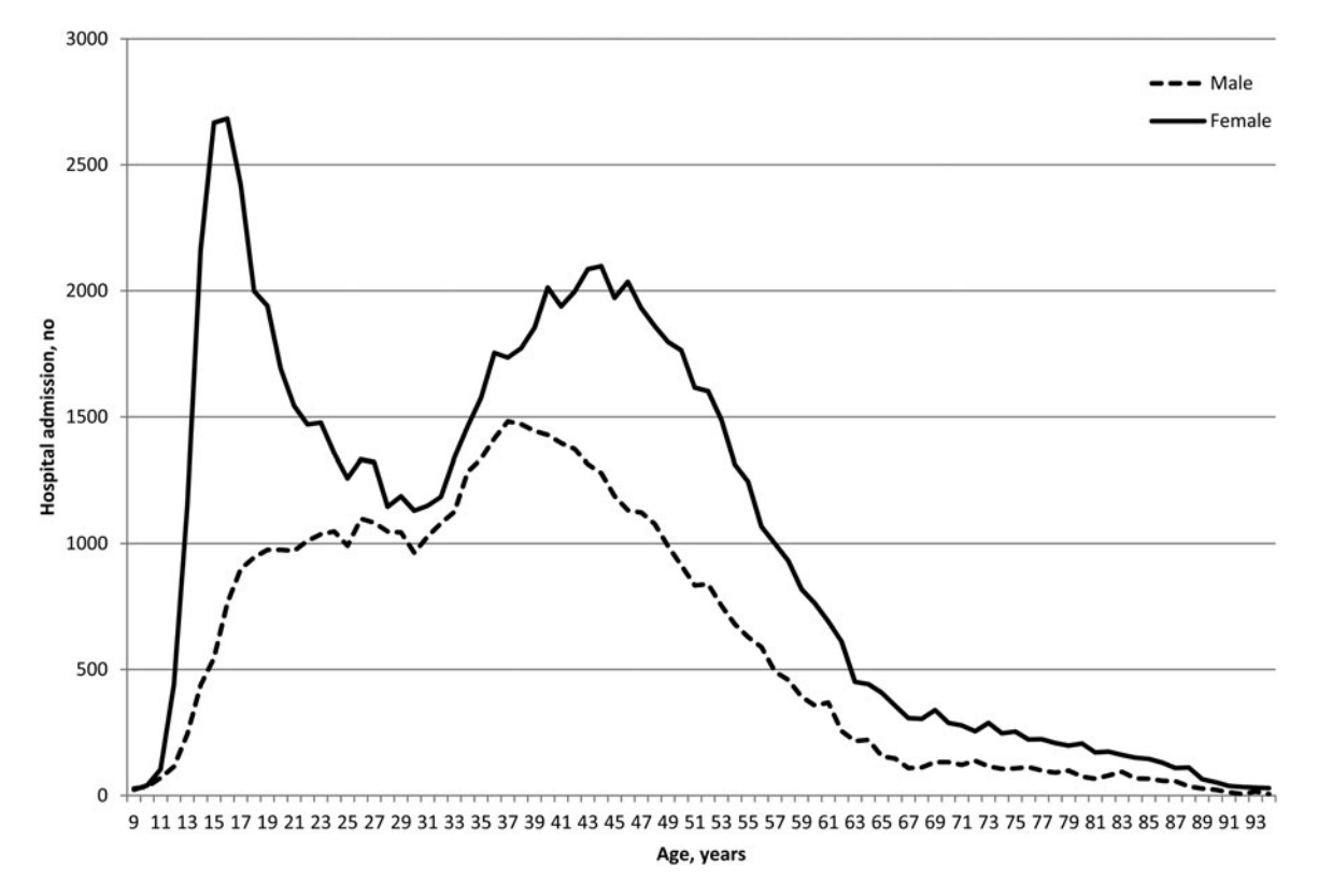
Fig. 2. Distribution of age at index hospital admission for deliberate self-harm, by gender.