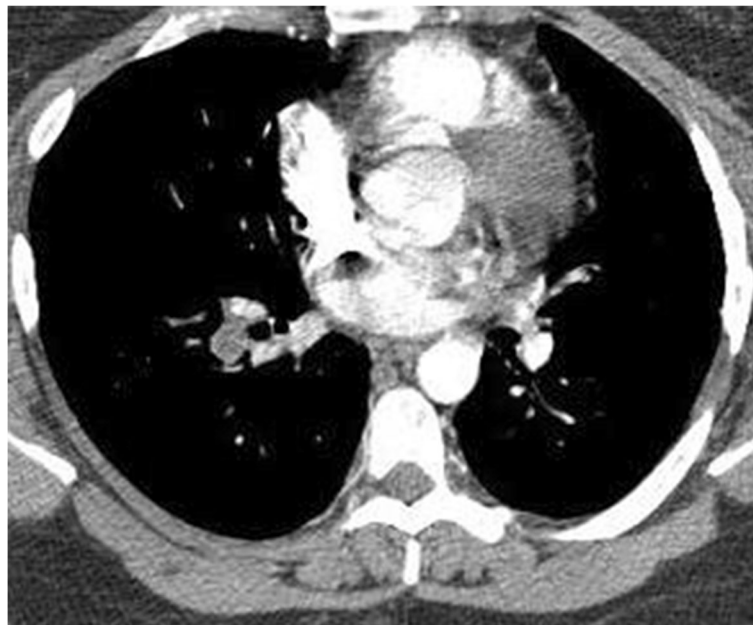
Fig. 1 Computed tomography angiography of the chest with right-sided arterial emboli. Coronal section of this patient’s computed tomography angiography demonstrates a filling defect within the pulmonary vasculature, most likely representing emboli. At the time of this study, the patient was being treated with a novel oral anticoagulant (rivaroxaban)

For over 60 years, warfarin has been the standard outpatient management option for VTE. It has proven efficacy for this indication, significantly decreasing thromboembolic events while maintaining an acceptable level of adverse events, primarily bleeding episodes [1, 3]. This has been confirmed by numerous prospective studies and in post-marketing clinical use, including trials conducted to compare the efficacy of conventional doses of warfarin with low doses for providing anticoagulation. Conventional doses of warfarin (INR 2.0–3.0) were shown to provide superior treatment for VTE when compared with low-dose therapy (INR 1.5–1.9), notably with no significantly increased risk for “clinically important” bleeding [1]. However, warfarin use is not straightforward and requires: (a) bridging therapy (the use of parenteral anticoagulants until appropriate levels are attained), (b) frequent