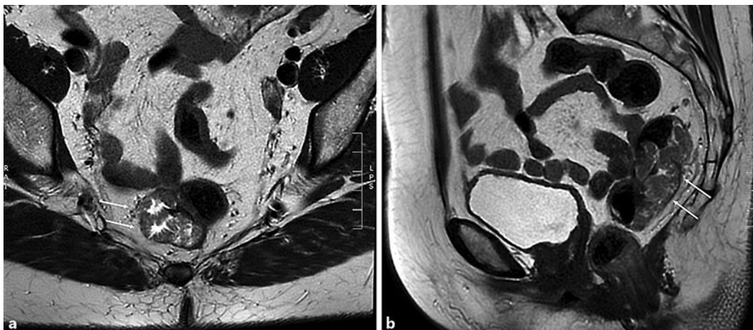
Fig. 1. a MRI of the 7 cm large rectal tumor with restriction of diffusion and focus of the probable invasive growth with penetration of the whole thickness of the bowel wall and incipient infiltration of the mesorectal fat. b Mesorectal fascia is intact and the lymph nodes are unsuspecting. There are no signs of vascular invasion.