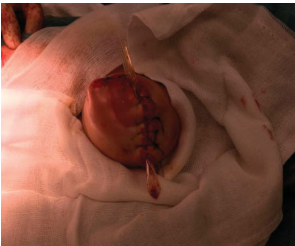
Fig. 4 Above knee amputation.

showed clear postischemic changes. The extent of brain tissue damage will be revealed during further development of the infant.