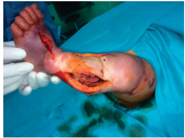
Fig. 2 Fasciotomies performed.