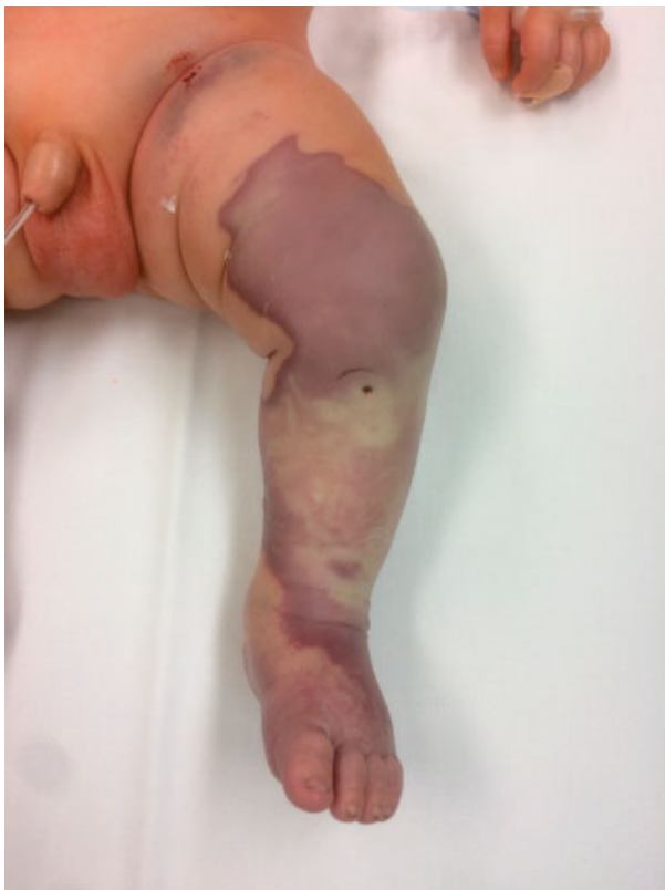
Fig. 1 Left lower limb on admission, a visible insertion site after intraosseous access.