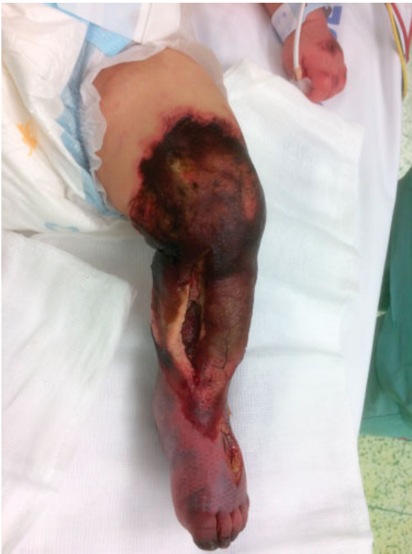
Fig. 3 Limb gangrene.