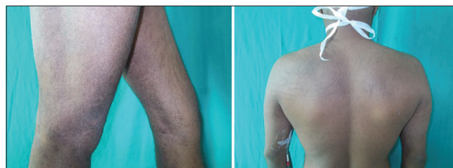
Figure 4: Subsidence of rash after treatment with bleomycin withdrawal and topical steroid application