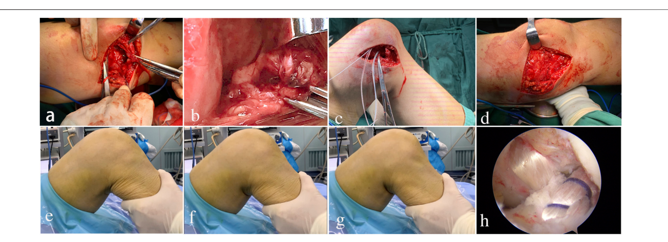
FIGURE 2 | Two-staged operation procedures. (A,B): in stage-1, the damaged MCL and other medial structures were exposed, which were found interposed into the condylar notch; (C,D): the torn MCL and medial retinaculum were replaced and repaired, and the dislocated knee was back to normal alignment following the suture of the medial joint capsule; (E–G): before stage-2 began, the drawer tests found notable anterior-posterior instability, that is, the anterior drawer test, (F), neutral position, (G), the posterior drawer test; (H): the ACL and PCL reconstruction in stage-2.

TABLE 1 | Basic characteristics and clinical conditions at baseline of the follow-up.