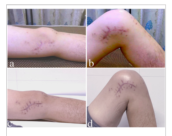
FIGURE 3 | Knee ROM at the intermediate rehabilitation and 1-year follow-up. ( A , B ): subject achieved a normal knee extension and flexion angle after the intermediate rehabilitation; ( C , D ): at 1 year follow-up, the same patient's knee extension and flexion angle showed a further increase.

Note: *pre-stage-2: just before the stage-2, operation began, when the stage-1 operation and rehabilitation of 6–8 weeks had been accomplished; IKDC: International Knee Documentation Committee.