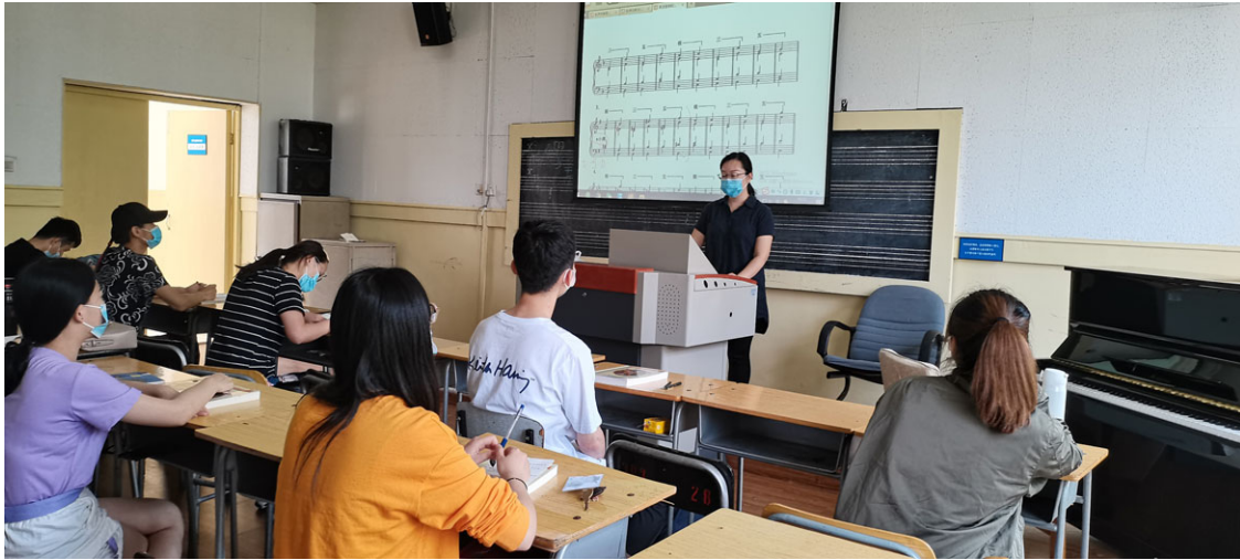
Figure 1 The situation of teacher and students wearing facemasks in class in a university in China.

Author Contributions. Y.Z, M.Z., and H.W. contributed equally to this work and are co-first authors. K.Z. and Q.W. contributed to the conception and design of the work. Y.Z., K.Z., and Q.W. drafted the manuscript. M.Z. and H.W. revised the manuscript. All authors gave final approval and agreed to be accountable for all aspects of work, ensuring integrity and accuracy.