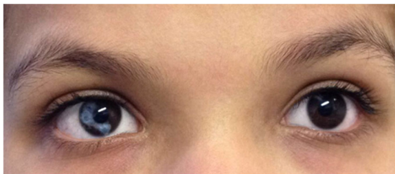
Fig. 1 Heterochromia iridis with a brown- and blue-colored iris, putatively caused by significantly increased MSH production due to severe adrenal insufficiency and HPA axis activation

The now 15 year old girl has been under regular attention in our pediatric endocrinology department since the neonatal period. Under 3-times daily hydrocortisone (9 mg/m 2 /day) and fludrocortisone (0,2 mg/day) substitution her electrolyte levels are balanced while the ACTH concentration remains elevated for a significant part of the day (4–688 pmol/l; ref. level 1,1–10,1 pmol/l). In particular during febrile infections in infancy her metabolic situation frequently deteriorated, sometimes associated with hypoglycemic/hyponatremic seizures.