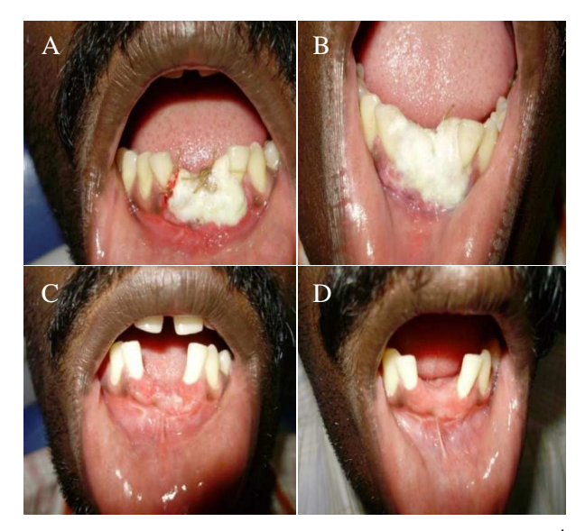
Figure 3. (A) 1^{st} week postoperative condition. (B) 2^{nd} week postoperative condition. (C) 1^{st} month postoperative condition. (D) 3^{rd} month postoperative condition.

Patient was recalled after one week and checked for healing. The surgical site was repacked (Figure 3A). Again he was recalled after 2 weeks (Figure 3B), 3 weeks, 1<sup>st</sup> month (Figure 3C) and 3<sup>rd</sup> month (Figure 3D). After 3 months, the patient was referred to Department of Prosthodontics for fixed prosthesis.