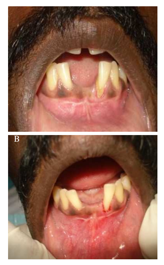
Figure 1. (A) Preoperative view of defect. (B) Mechanical debridement was done.

Grade II gingival recession had the following characteristics: recession width of 3 mm in lower left lateral incisors, recession depth of 5 mm in lower left lateral incisor and 3 mm width and depth in right lower lateral incisor. Phase I therapy was performed of complete scaling and root planning (Figure 1B).