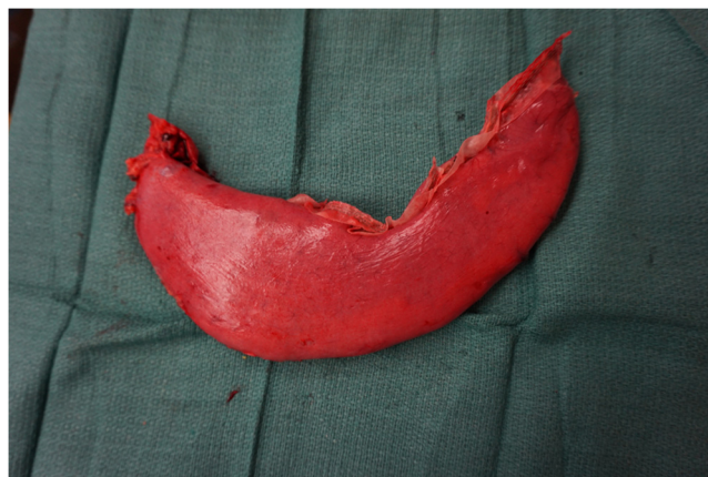
Fig. 3. The sleeve gastrectomy was performed over a 36 bougie in the absence of any contamination of the operative field.

from BMI 52.2 kg/m 2 (Approximately 32% excess weight loss three months postoperatively). Follow-up CT to assess the status of the appendiceal malignancy will be performed every 6 months for 3 years and then yearly for a total of 5 years.