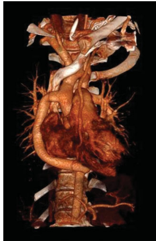
Fig. 3 Postoperative computed tomography scan showing patent extra-anatomic conduit coursing along the right heart border.

For these reasons, we decided to treat the patient by means of extra-anatomic aortic bypass. In this way, we were able to relieve the obstruction while working far from the coarctation site. Our experience confirms the safety and