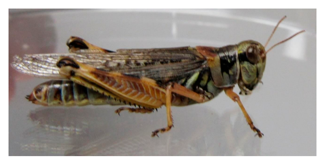
Figure 1. Female Melanoplus sanguinipes grasshopper. (Wahid Dakhel, 2014). University of Wyoming, Laramie, WY, USA.

Approximately 15 of the 400 western US grasshopper species are considered major economic pests of either range or croplands [8]. Nationwide, four grasshoppers' species are responsible for about 90% of all grasshopper crop damage [2,9], Melanoplus sanguinipes , M. bivittatus , M. differentialis , and M. femurrubrum (Figures 1–4). Most grasshoppers are highly polyphagous and feed on a wide variety of plant species [10].