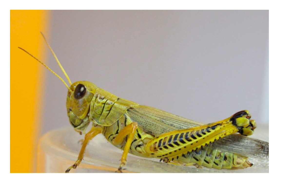
Figure 3. Female Melanoplus differentialis. (Wahid Dakhel, 2014). University of Wyoming, Laramie, WY, USA.