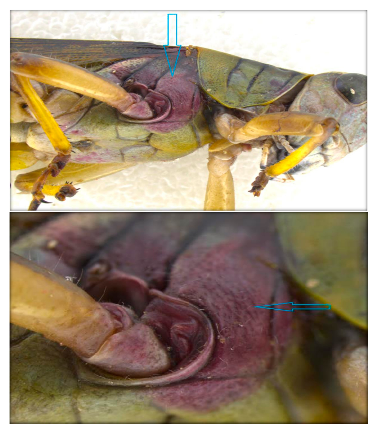
Figure 5. Adult female of M. bivittatus infected by S. marcescens . Note the distinct red tint on the thorax. (Wahid Dakhel, 2013).

is entomopathogenic bacterium. It leads to internal and external symptoms and signs of disease, including red diarrhea, and produces red pigments that present on the insect body (Figure 5).