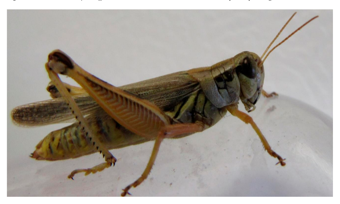
Figure 4. Female of Melanoplus femurrubrum . (Wahid Dakhel, 2014). University of Wyoming, Laramie, WY, USA.

They can consume as much as their total body weight per day, but this amount varies with the species and developmental stage [11]. Annually, forage losses to grasshoppers in the western US are around 25%, which exceeds damage from all other rangeland arthropod families [3,9,12]. Historical records of severe grasshopper damage in North America are documented from the second half of the 19th century, when devastating Rocky Mountain locust ( Melanoplus spretus ) swarms decimated crops and rangelands from Central Canada to Texas [13]. From 1874 to 1877, M. spretus infestations were extremely expansive and severe over large areas of the Great Plains, which led to the institution of the United States Entomological Commission by Congress to study and control grasshopper plagues [14]. Later on, in the 1930s, grasshopper outbreaks covered millions of hectares of federally