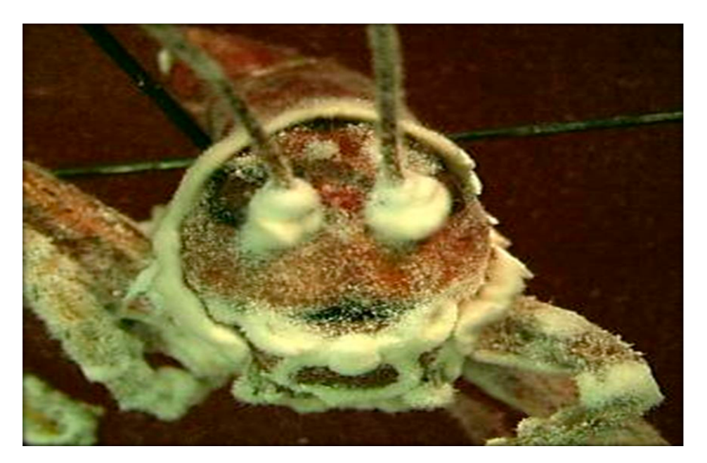
Figure 7. Beauveria bassiana emerging from the intersegmental of its host, a Mormon cricket (Anabrus simplex Haldeman), and conidiating on the surface of the cuticle [66].

Several species of fungi are known to infect Orthoptera. Beauveria bassiana has been successfully field-tested for the control of rangeland grasshoppers using water and oil formulations, and it has been registered as a commercial product for that purpose in the US [69]. Beauveria bassiana is distributed worldwide and occurs naturally in the soil, causing "white muscardine disease" (Figure 7) [69].