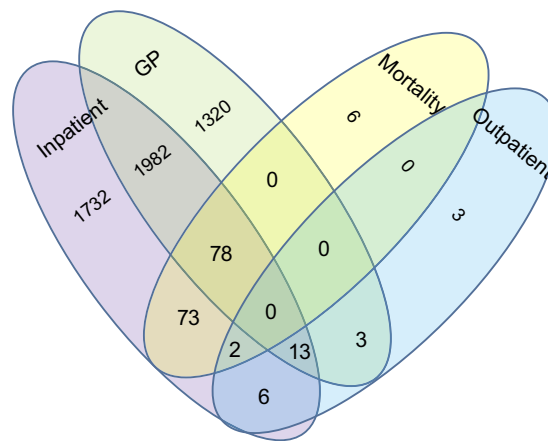
Figure 2 Venn diagram showing the sources of identification of 5,218 CP cases within the Welsh dataset (1979–2014).

Abbreviations: CP, cerebral palsy; GP, General Practitioner.