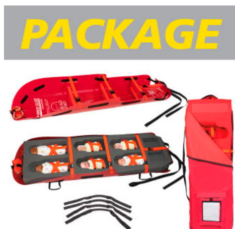
Figure 2. Med Sled® Infant 6 insert.

even noted how they could place the ventilator in the sled for a baby that needed it. This is one of other potential solutions to navigating babies going down the stairs, if the elevators are not working, an important component to evacuation.