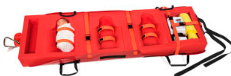
Figure 3. Med Sled® infant insert that can hold up to three infants.

Some participants took away getting as much supplies as they could if a disaster were to strike again and cause a NICU to evacuate; one hospital specified grabbing formula bottles and nipples. Two participants spoke of backpacks, with one putting together a daypack, a small backpack for each baby in case of emergency with formula, wipes, diapers, and feeding tubes and another revamping their backpacks.